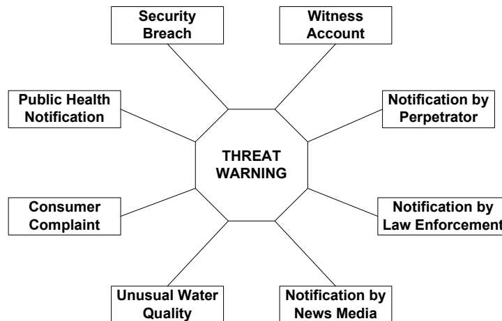
Figure III-2. Summary of Potential Threat Warnings